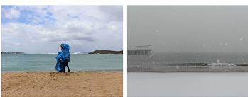
Kevin Quiles Bonilla Carryover (Blue tarp in Vega Baja/Coney Island), 2021 Carryover (Blue tarp) series Digital Print/C-Print 20x61