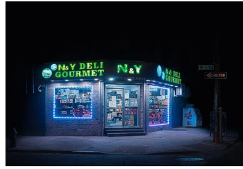
Richard Acevedo W Kingsbridge Rd, 2020 Midnight Bodega series Digital Print 24.38"x34.38"