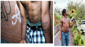
Bashira Webb Death B4 Sunflowers, June 2020 VALID! series Digital Print 17x22