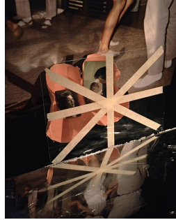
Sydney King Okaeri , 2020 Entanglement series Pigment Print 21.5x26.5