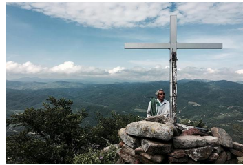
Roy Baizan Lalito At The Top of La Peña, 2016 Entre Dos Pueblos series Archival Pigment print 19x24