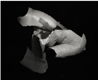
Sydney King Entanglement , 2020 Entanglement series Silver Gelatin Print 32x40