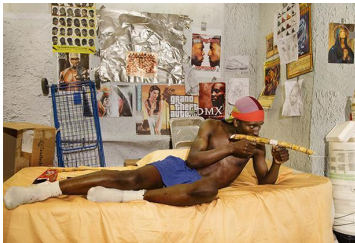
Daveed Baptiste Boy Dreams, 2018 Haiti to Hood series Mixed Media 22x15