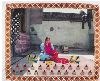
Spandita Malik RUKMESH KUMARI, 2020 Nári (2019-ongoing) series Photographic transfer print on Khaddar, Phulkari silk thread embroidery 40x29